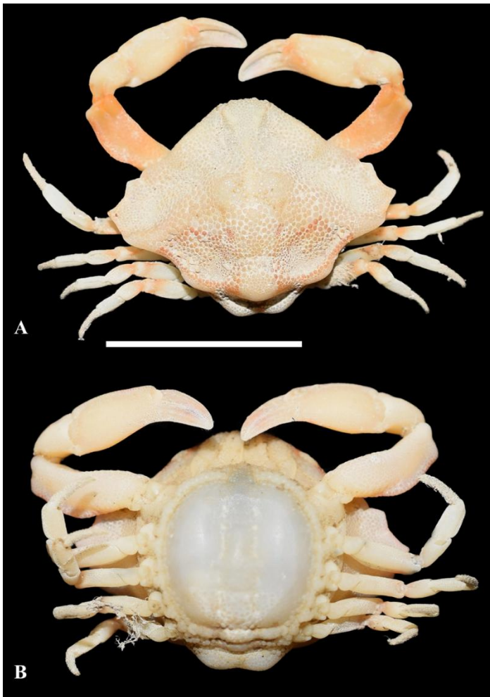
Figure 1. Nursia plicata (Herbst, 1803), FRSACDB-78, female: (A) dorsal view, and (B) ventral view (scale = 10 mm).

sandy substrates mixed with clay and stones in the subtidal zone at depths ranging from 3 to 49 meters (Stephensen, 1946; Naderloo, 2017). In the present study, observations were made on a sandy-clay substrate in the lower intertidal zone at Sikka Reef.