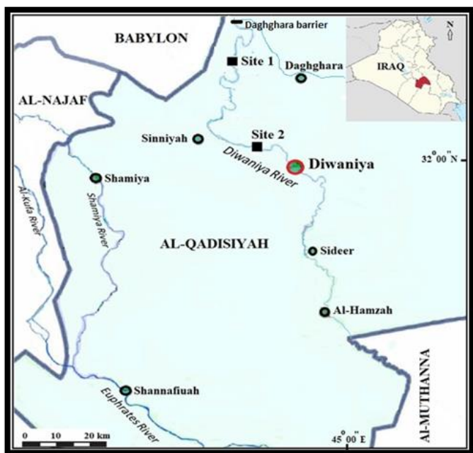
Figure 1. Map of field sampling sites in River.

laboratory at the University of Al-Qasim Green's College of Veterinary Medicine for further examination.