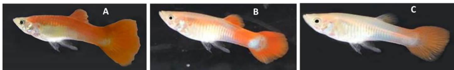
Figure 3. Variation of the body and fin color of Poecilia reticulata after 85-day trial (A) - Biofloc treatment (B) Control-1 with water exchange, (C) Control-2 with zero water exchange.